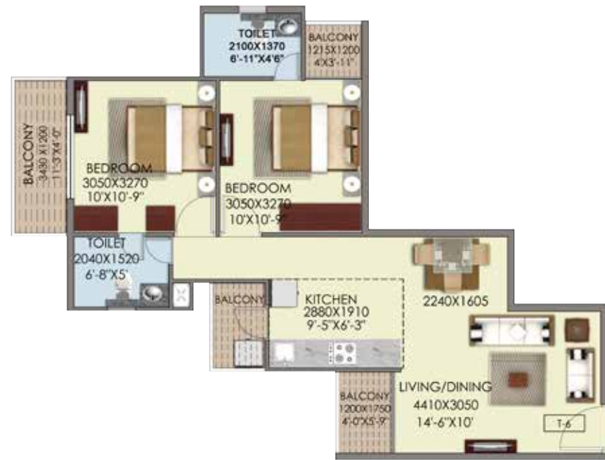
CARPET AREA: 584.34SQFT BALCONY AREA: 108.24 SQFT