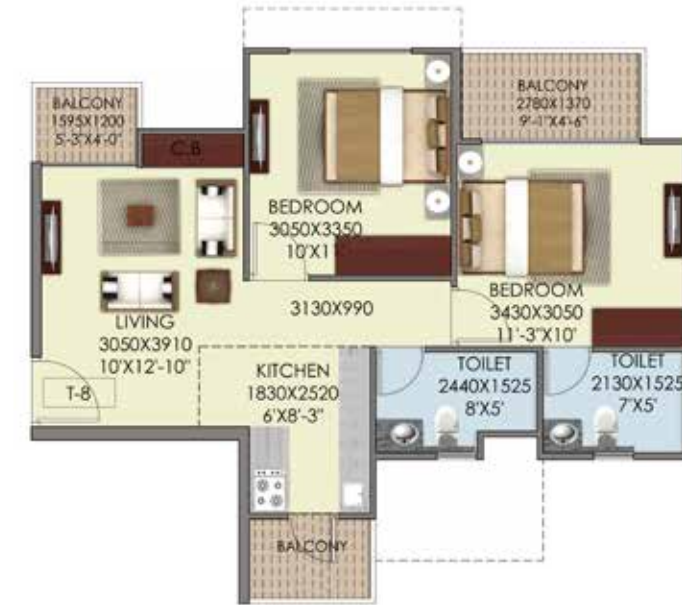
CARPET AREA: 532.53 SQFT BALCONY AREA: 89.53 SQFT